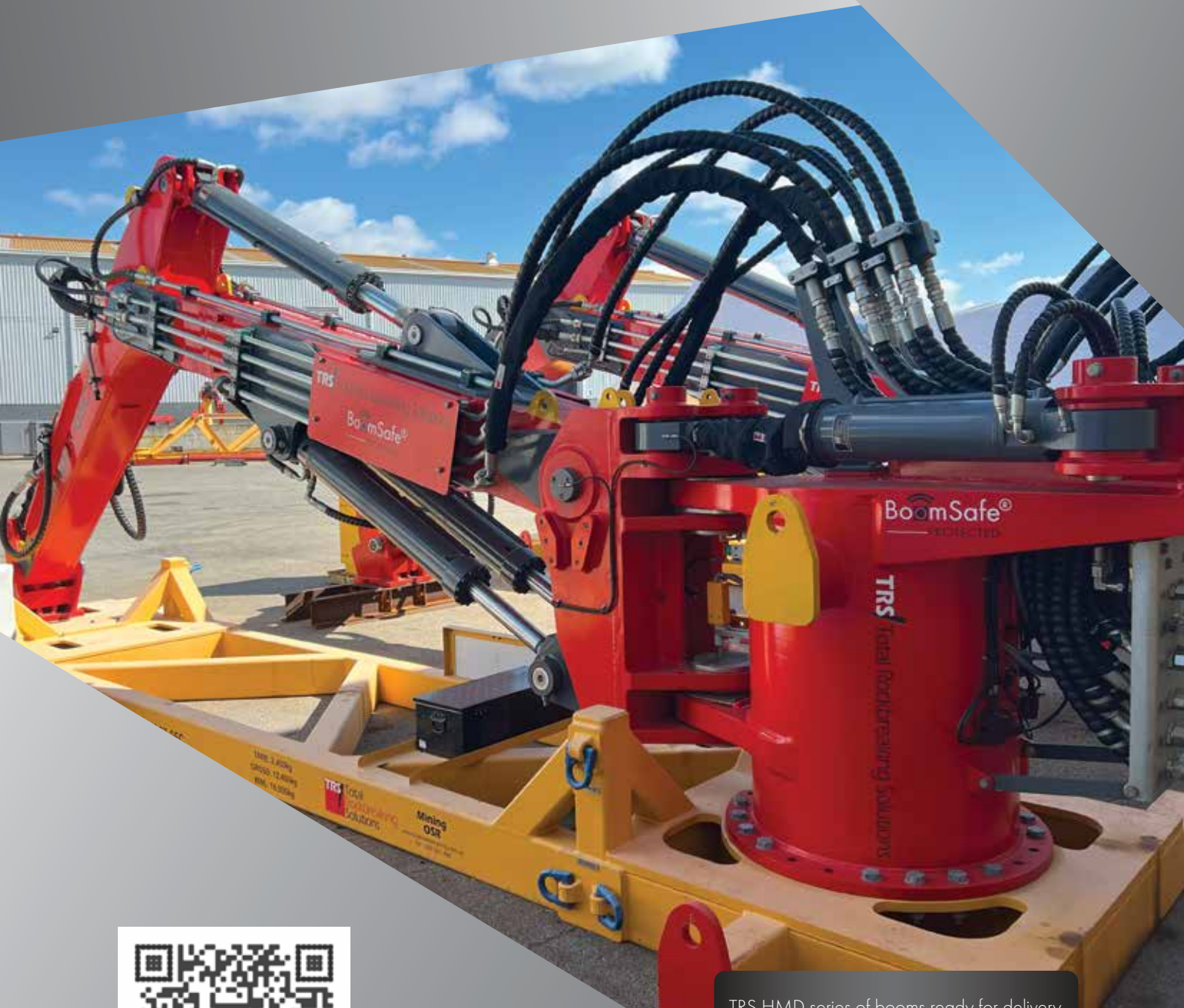
TRS HMD series of booms ready for delivery