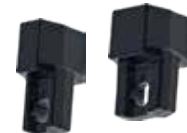
Long blade 40 & 60 XHD for screening and aerating compost and other soft materials to increase capacity.