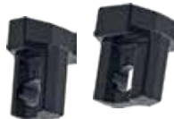
Universal blade 40 & 60 XHD for most applications and materials. Good durability.